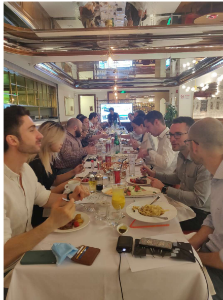
Overview of the long table and restaurant